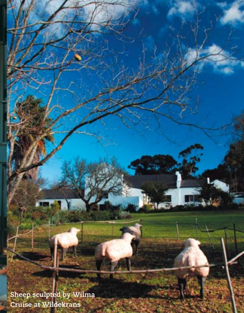
Sheep sculpted by Wilma Cruise at Wildekrans