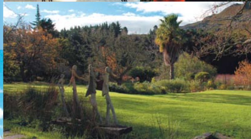
Wildeckrans Country House