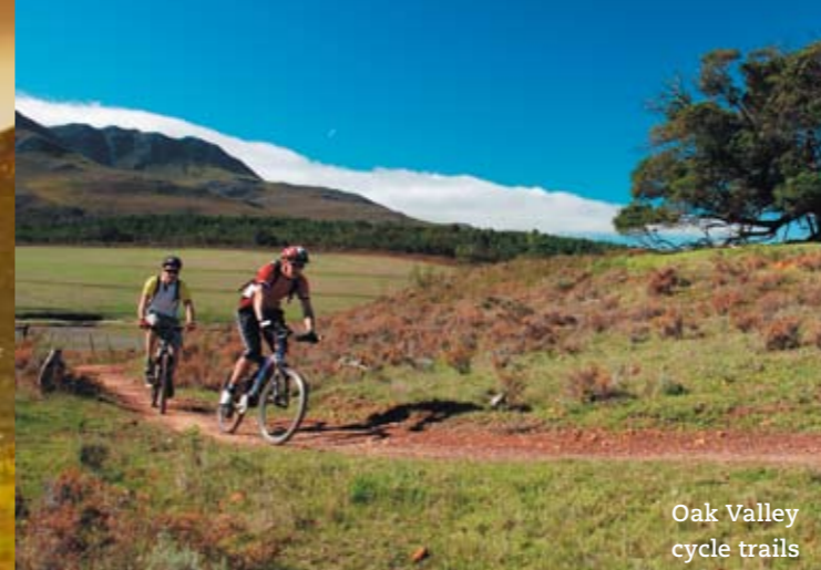
Oak Valley cycle trails